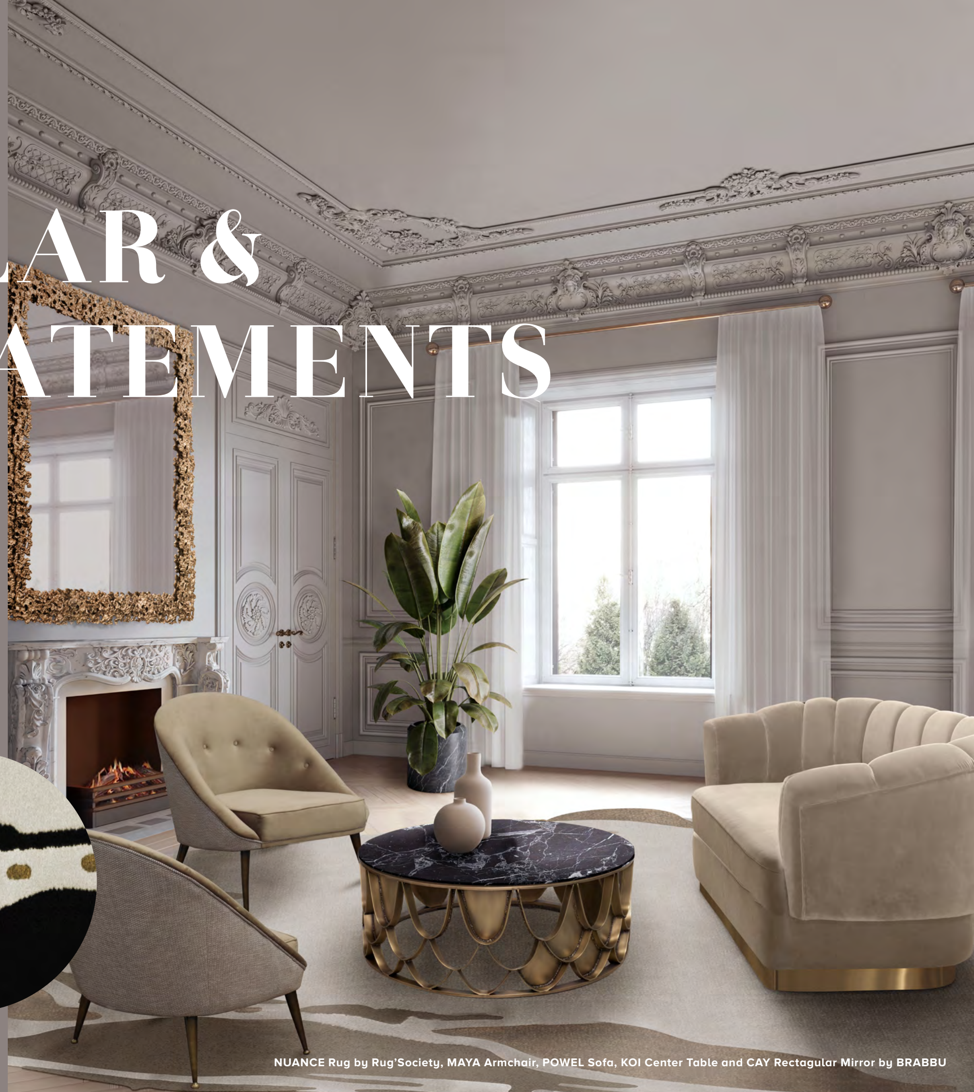
NUANCE Rug by Rug'Society, MAYA Armchair, POWEL Sofa, KOI Center Table and CAY Rectangular Mirror by BRABBU