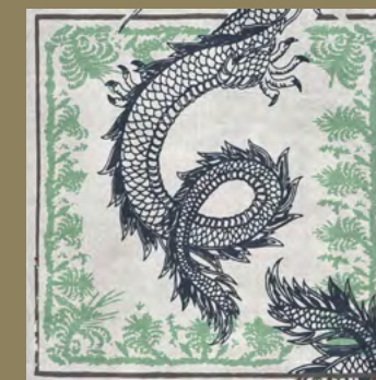
REDLEH SQUARE RUG