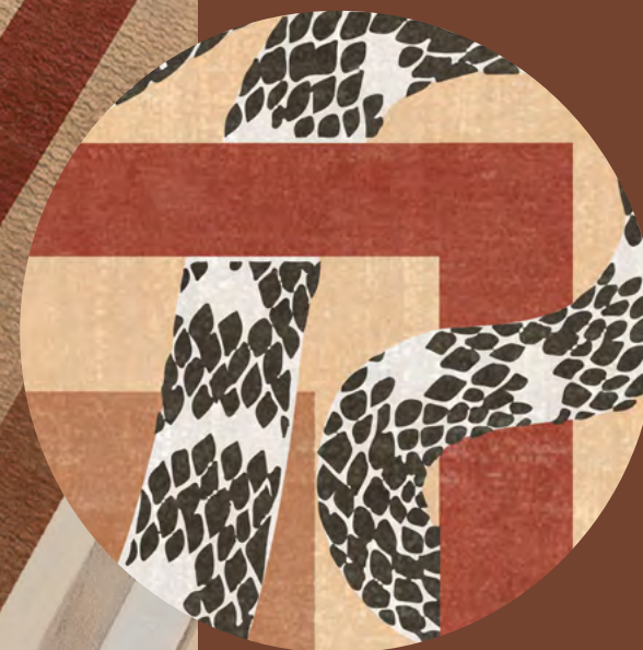
IMPERIAL SNAKE II RUG

Rug'Society offers fully customized rugs that cater to the specific needs of each space. Like our Imperial Snake II Rug , every aspect of the rug, from shape, size, and color to intricate detailing, is crafted with precision, ensuring it harmonizes perfectly with any interior design vision. This unique, custom-made rug will not only transform spaces but also bring an artful statement to the floor, with its distinctive forms.